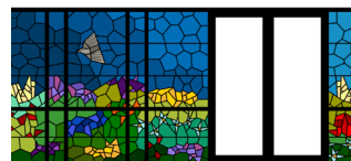
Front Entrance Stained Glass